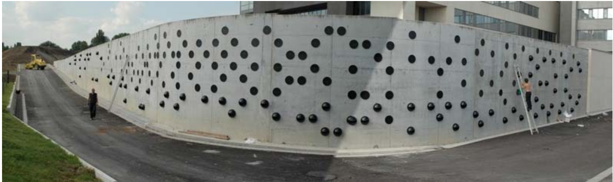
Work in progres

Kunst integratie project Jan Yperman ziekenhuis Ieper 2008-2009